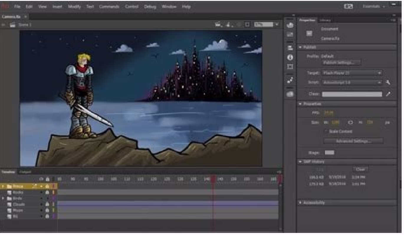
Best free cartoon animation software. Cartoon animation making software free download.